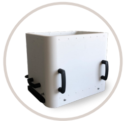
Stratasys H350 build removal box