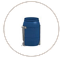
Stratasys H350 powder container