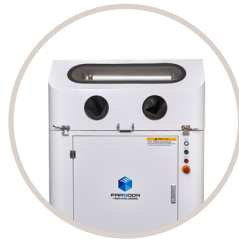
Powder retrieval station

Solution for Stratasys H350 printer or your choice